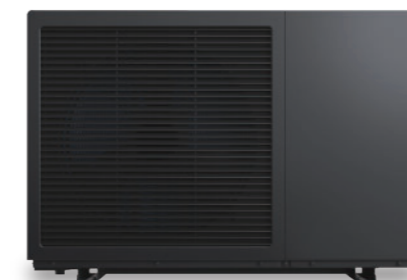
BLN-006|012 TC1 BLN-012 TC3

Solareast R290 air source heat pump offers eco-friendly and energy-efficient heating and cooling solutions. Utilizing propane (R290) as the refrigerant, it ensures exceptional efficiency while reducing environmental impact. With its advanced technology, it achieves significant energy savings, making it a cost-effective choice for both residential and commercial spaces. The ultra-low Global Warming Potential (GWP) of 3 minimizes greenhouse gas emissions, contributing to a greener planet. Designed for silent operation and easy installation, it provides reliable and hassle-free comfort. Embrace the future of sustainable heating and cooling with our R290 air source heat pump, enjoying the eco-smart performance, energy savings, and superior comfort.