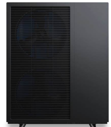
BLN-018 TC1 BLN-018TC3